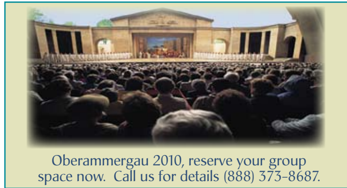
Oberammergau 2010, reserve your group space now. Call us for details (888) 373-8687.

trips have always been popular, especially within church affiliations, but a new trend is the growth of faith-based cruises. Mixing leisure travel with Christian fellowship has become ever popular among hundreds of churches. For the travel industry, this is especially exciting as 75 percent of these faith-based cruisers are "new to cruising," 1 unveiling an untapped segment of the market. For those seeking to further experience their faith right here in the U.S., first-class religious attractions collectively welcome millions